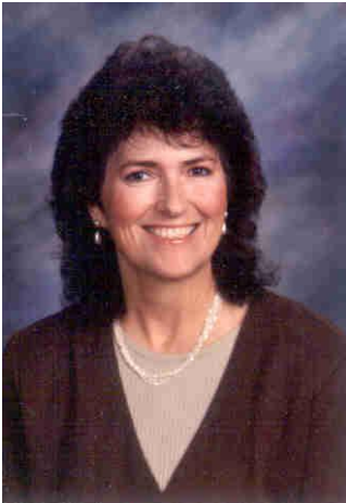
Box Elder Middle School